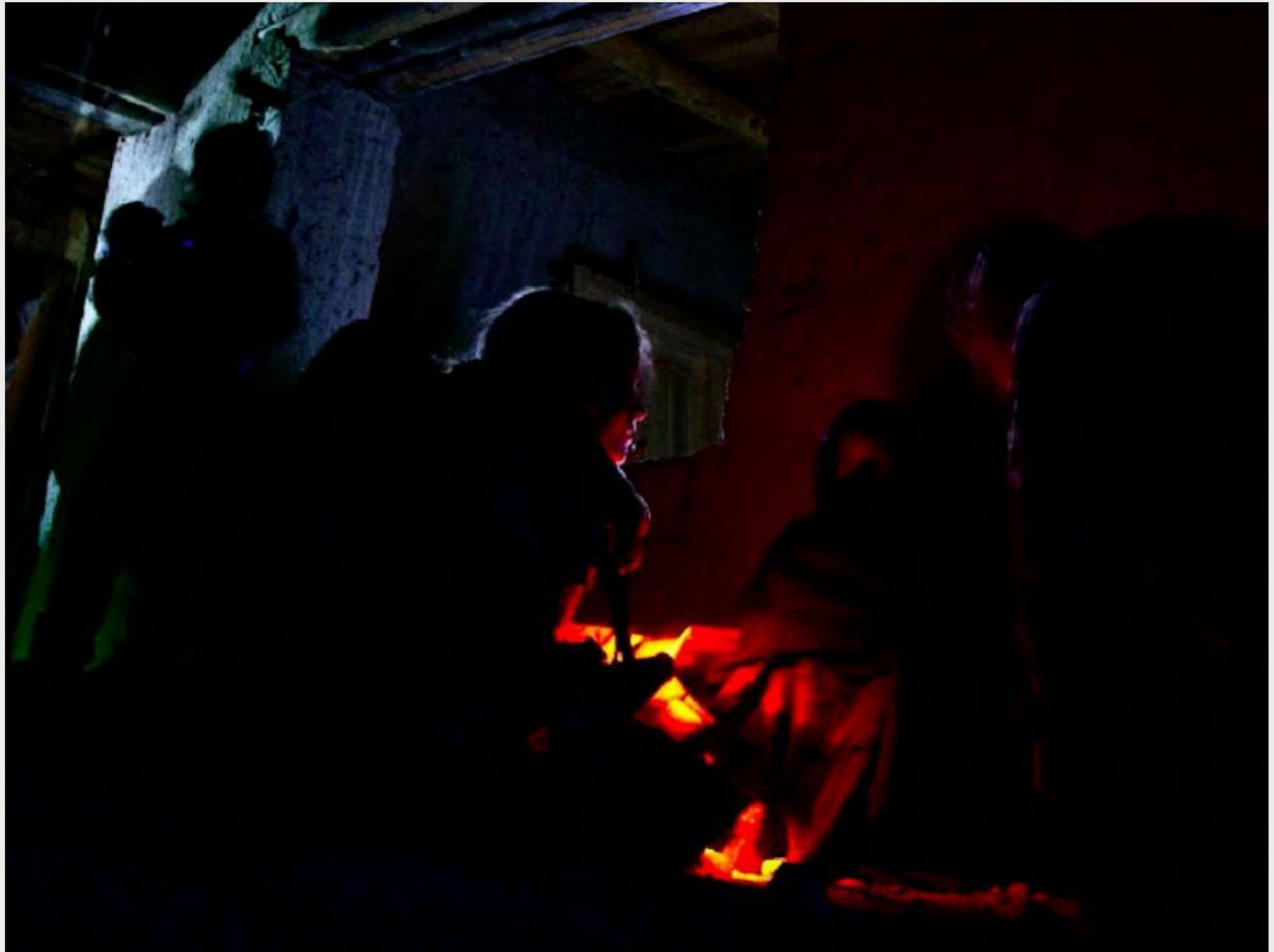
CST night raid, photograph from Ashley's War