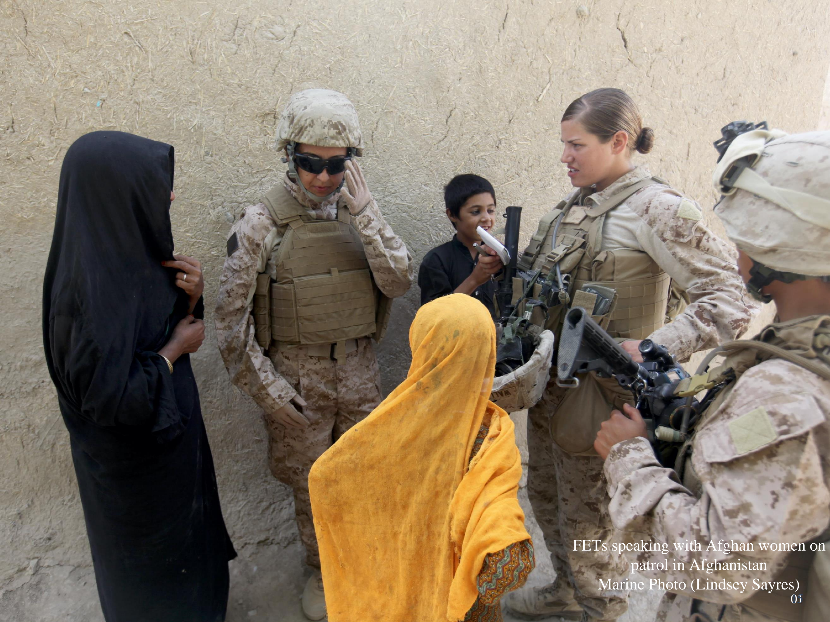
FETs speaking with Afghan women on patrol in Afghanistan Marine Photo (Lindsey Sayres) 0i