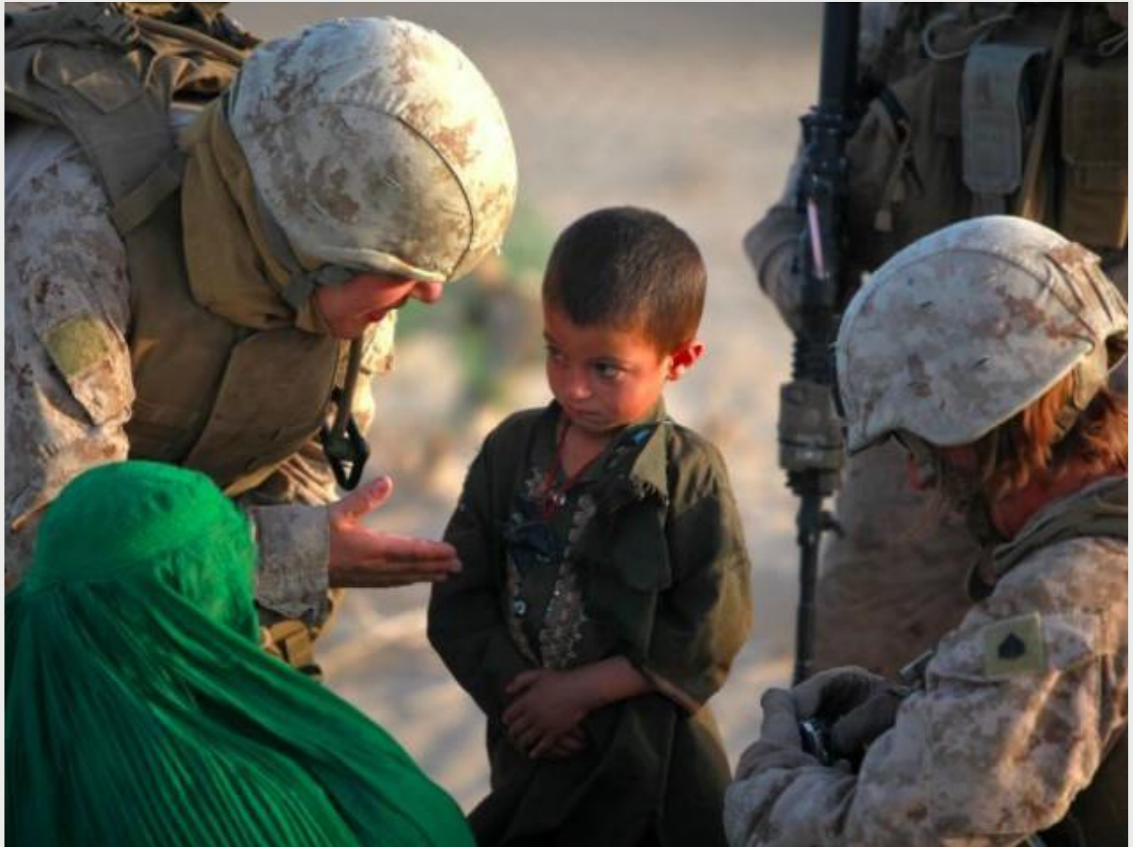
Female engagement team questioning woman and child during vehicle interdiction, Afghanistan.