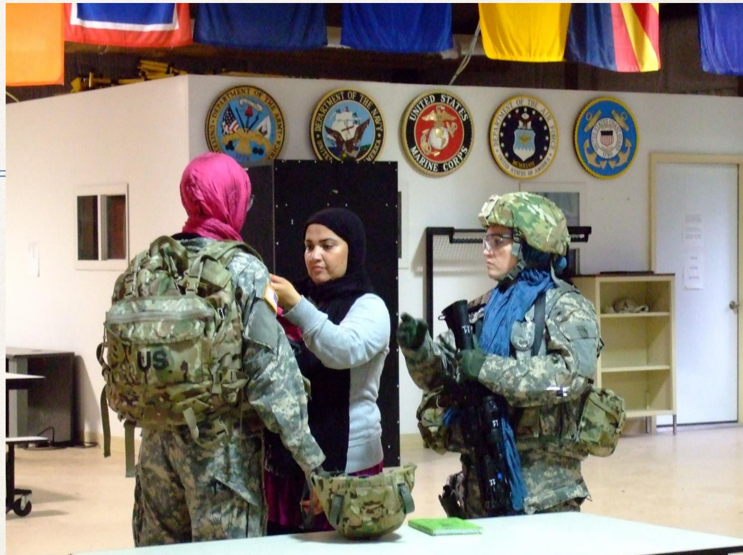
Afghan role-player shows female military personnel how to wear headscarf US army training (2011)

March 21, 2024 Seminar on WPS Agenda Belgian EU Presidency Tournai, Belgium