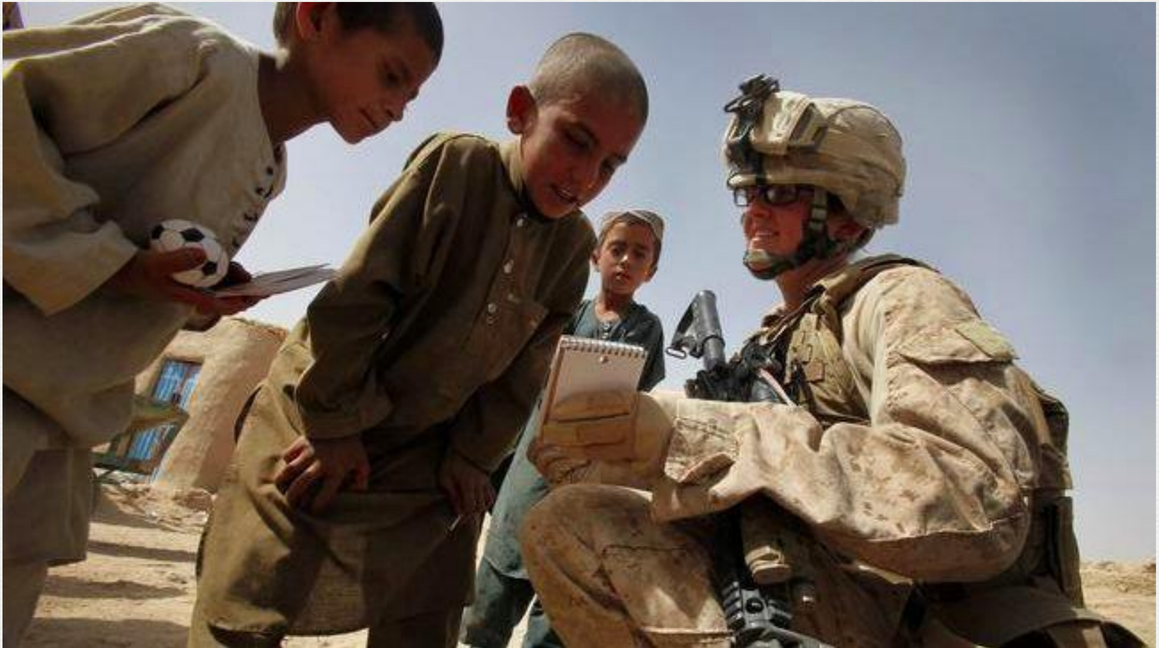
Female engagement team (FET) member speaking with Afghan boys. Image from San Diego Union Tribune article, “Marines find gender useful as a weapon in Afghanistan”