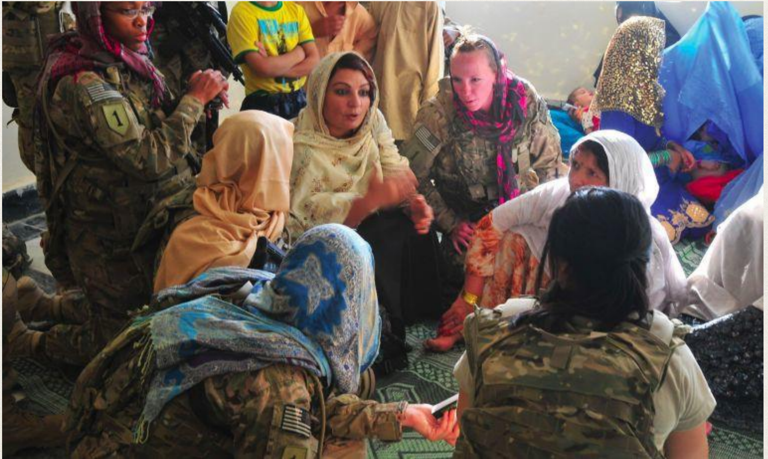
Image from Military Review article, caption reads: “Members of a female engagement team discuss the needs and wants of the female population and to help improve their way of life.”